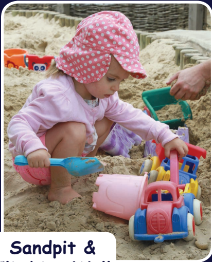
Sandpit & Climbing Wall