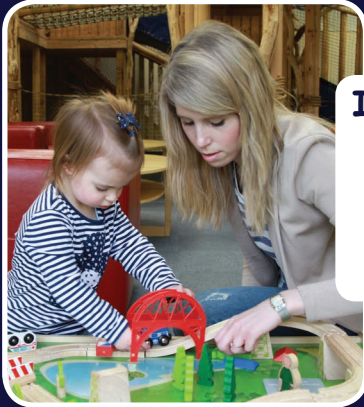
Indoor Play Area with separate Under 5's Area