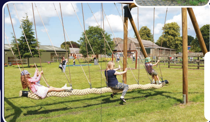
Outdoor Play Area & Ground Level Trampolines