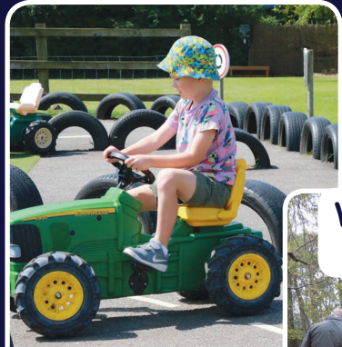
Pedal Tractors (Toddlers & Children)