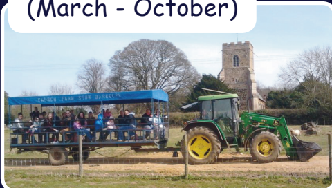
Tractor & Trailer Rides (March - October)