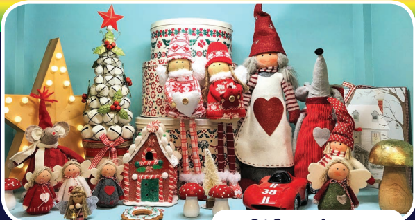
Gift Shop, Lunches, Teas with Homemade Cakes