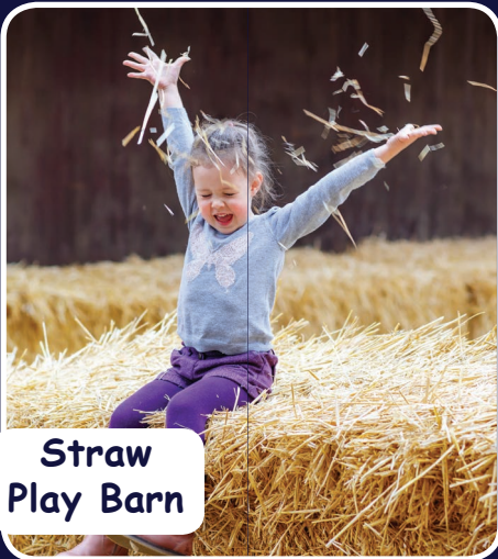
Straw Play Barn